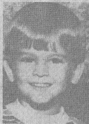
[redacted] Roffman: Considers himself a Jew.